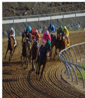
(A race at Horsemen's Park, the Omaha track owned by the Nebraska horsemen.)

National HBPA Conference panels March 4-6 to include AI, prediction markets, horsemen as racetrack owners