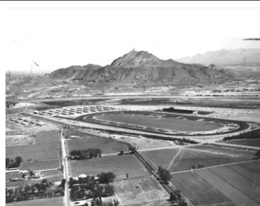
06/08/1966 Sunland Park Racetrack