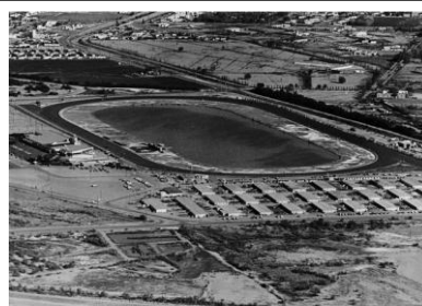
April 1985, aerial photo of Sunland Park Racetrack.