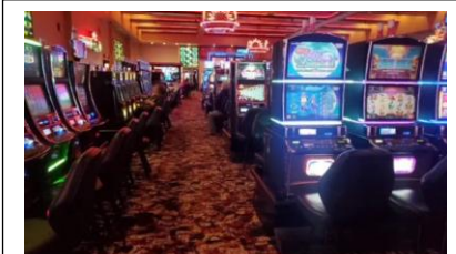
Gaming machines in the Sunland Park Casino & Racetrack in Sunland Park, New Mexico.