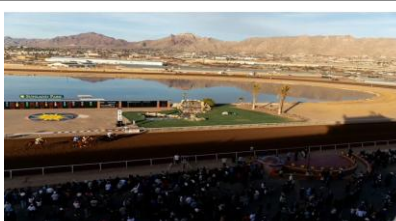
Seen is the final race of the day at Sunland Park Race at Sunland Park Racetrack & Casino in Sunland Park, New Mexico, Sunday, February 16, 2025.