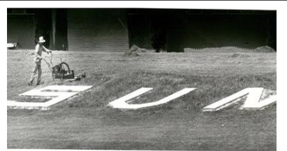
File photo: Sunland Park Racetrack.