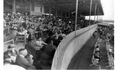
06/08/1966 Sunland Park Racetrack