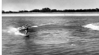
9/22/1959 Sunland Park Racetrack - Water Skiers had a field day at Sunland Park Sunday, after the lake at the track grounds was filled. Here Sharon Swift takes a spin about the lake.