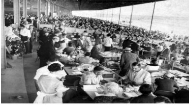
10/09/1959 Sunland Park Racetrack - The El Paso Southwest turned out en masse for the opening of Sunland Park's 45-day racing season Friday, Oct. 9, 1959.